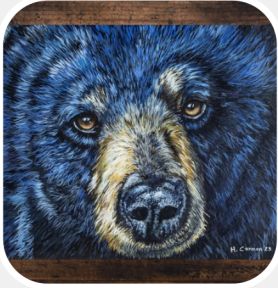
Holly Cannon Brutus acrylic