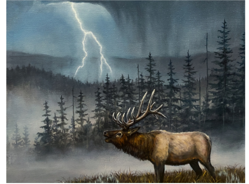
September Storm, Elyssa Leininger, oil

May 1st - Sept. 30th Tue. - Sat. 9:00 am - 5:00 pm