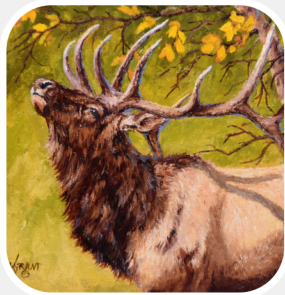
Mimi Grant In the Breeze oil