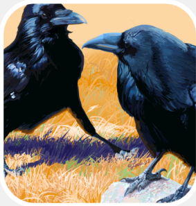
Pam Little On Higher Ground digital painting